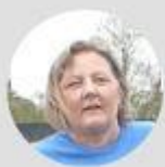
Sarah AJW Distribution

Each day approximately 11 people in Cambridgeshire are admitted to hospital with a brain injury. For many of these people this is a life-changing event that requires dramatic readjustments. Anyone could suffer a brain injury at any time and the effects of that brain injury can be wide ranging, which means that each individual with a brain injury will have very different and complex needs. The problems that people with a brain injury, and their families, face every day affect every aspect of their lives, including their finances, employability, housing and relationships. Without support many would become isolated, distant from the communities they live in and face declining physical and mental well-being.